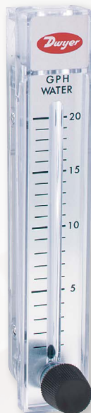
Model RMB-SSV 5" scale, 8-3/4" high