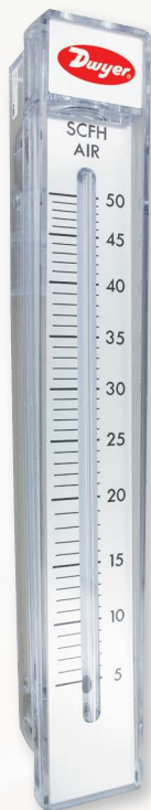
Model RMC 10" scale, 15-3/8" high