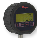
DPG-100 with protective rubber boot