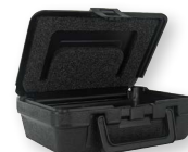
Protective carrying case