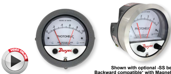
Shown with optional -SS bezel Backward compatible* with Magnehelic® gage